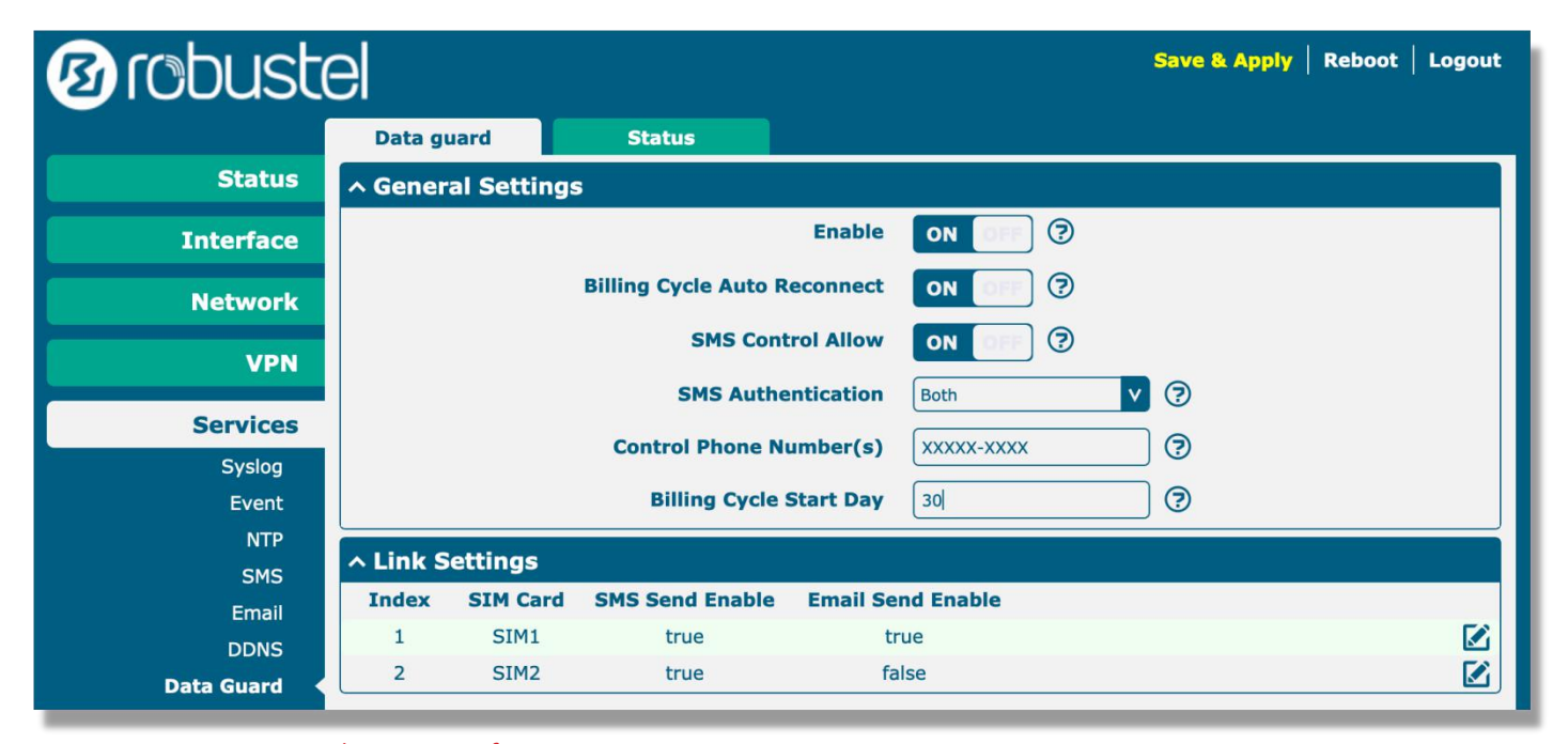
Figure 2.0 - DATA-Guard v2 App Config screen

It can also help to take the risk out of using Public IP addressable SIMs. By lowering the data connection when the router is not in use (such as in a proof of concept) the risk of online portscanners/net-scanners racking up high data usage can be reduced.